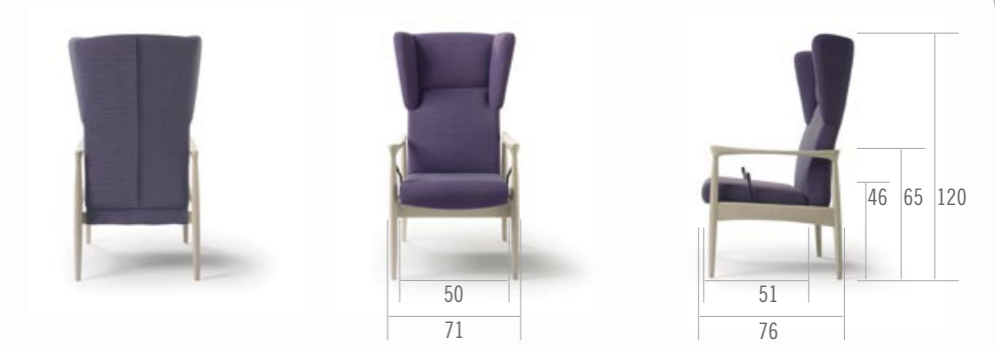
relax pia 49-63/3RG gas movement