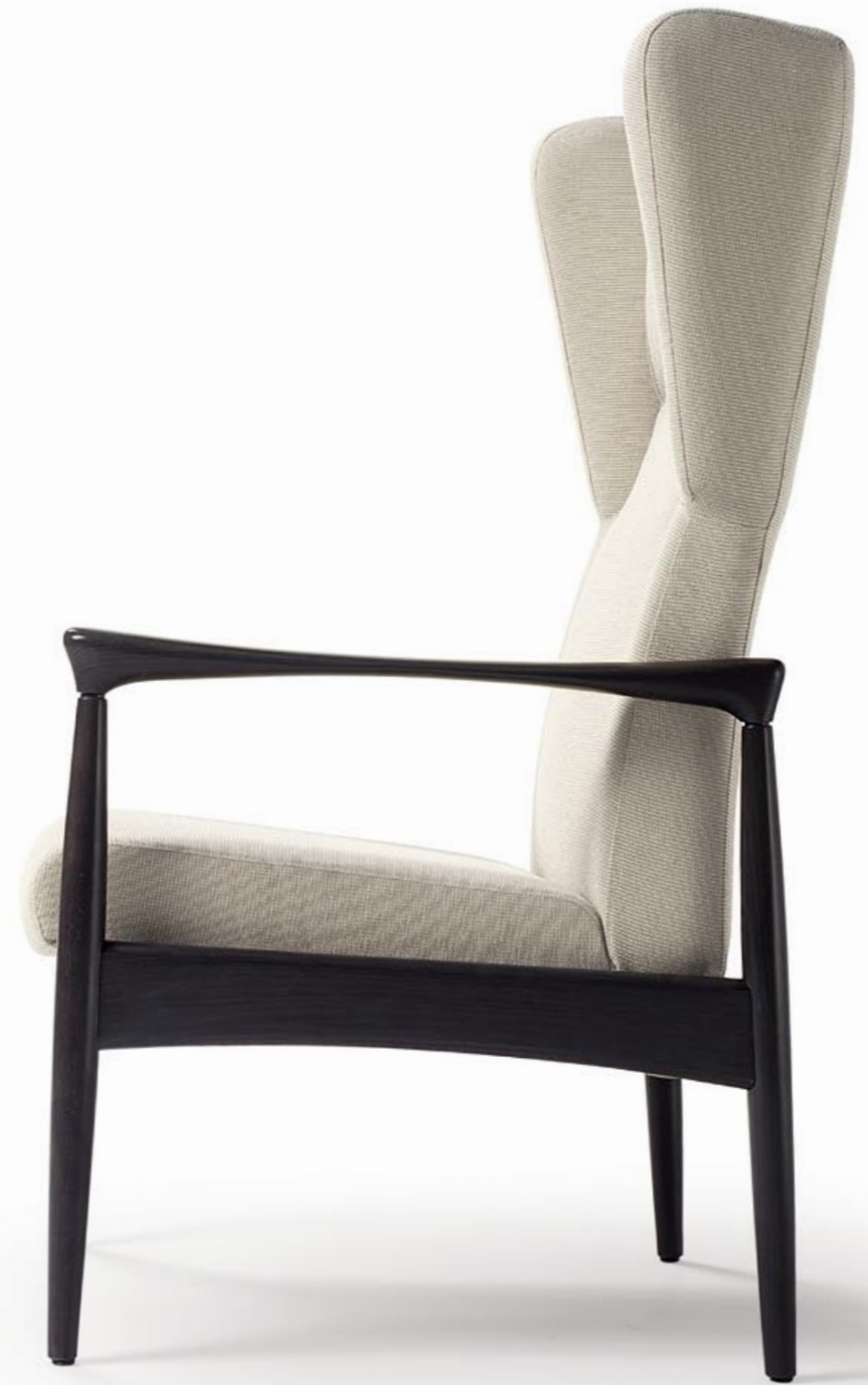
relax pia 49-63/3 fixed position